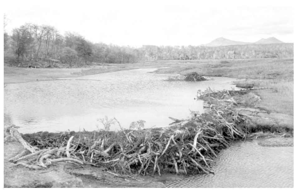
Figure 3. Flat valley and adjacent wet area

Austral beavers forage on trees of the genus Nothofagus ( N. betuloides, N. pumilio and N. antarctica )