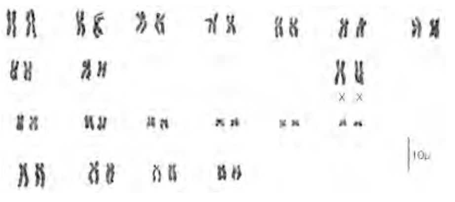
Figure 2. Conventional karyotype of fuegian beaver, 2n=40.

Beavers colonized all streams and occurred in nearly all aquatic habitats. Low gradient ( 0-6^{\circ} ), first and second order streams were selected by beavers. Higherorder streams were seasonally occupied (Coronato et al. , 2003). The rivers of the lateral hanging valleys were more densely occupied than those of the slope units. Clear-cutting by beavers in riparian forests dominated by deciduous ( Notophagus pu milio ) or evergreen ( N. betuloides ) species promoted the formation of grasslands with high productivity, probably due to in-