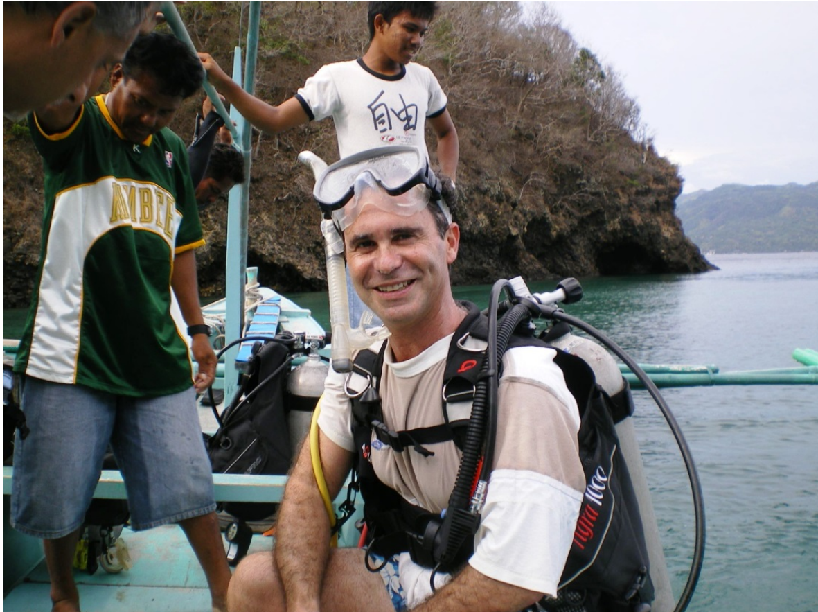
Preparado para bucear en Batangas, Filipinas, mayo de 2008