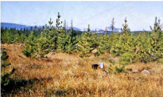
Photo 3. Open pine—grasslands on the Lewis and Clark National Forest.