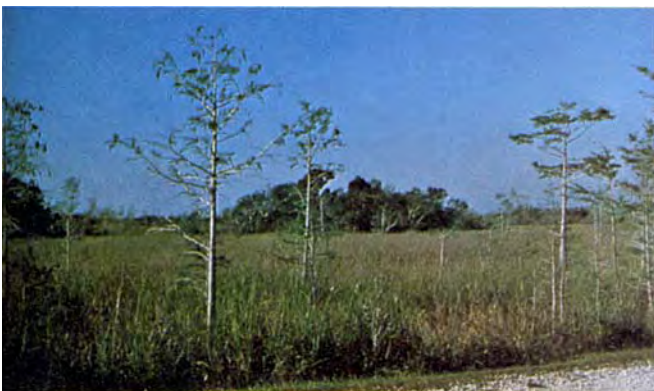
Photo 8. Sawgrass "prairie" and "strands" in the Everglades National Park, Fla.