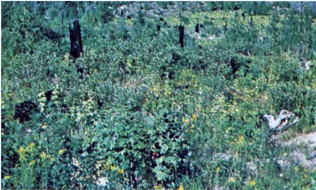
Photo 14. Regeneration shrublands after fire or other disturbances have a large green fuel component, Sundance Fire, Pack River Area, Idaho.