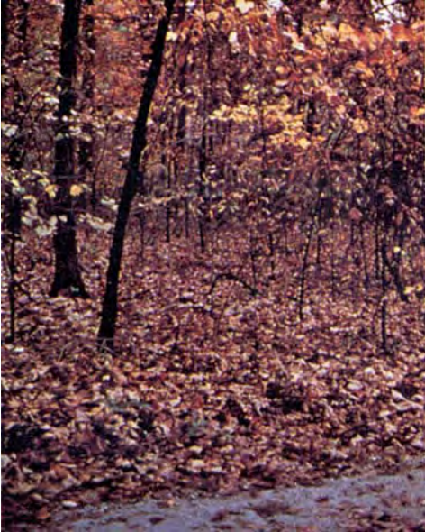
Photo 25. Western Oregon white oak fall litter; wind tumbled leaves may cause short-range spotting that may increase ROS above the predicted value.