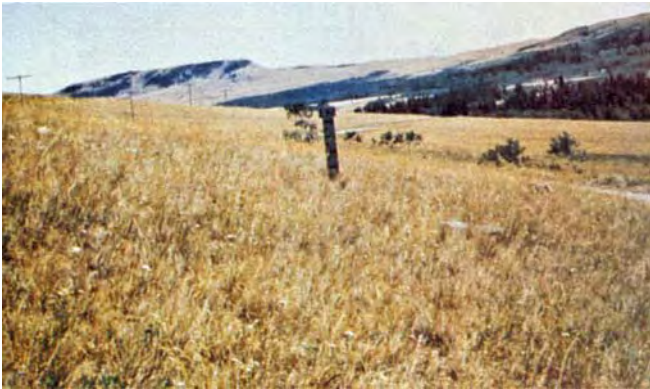
Photo 1. Western annual grasses such as cheatgrass, medusahead ryegrass, and fescues.