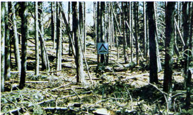
Photo 32. Mixed conifer partial cut slash residues may be similar to closed timber with down woody fuels.