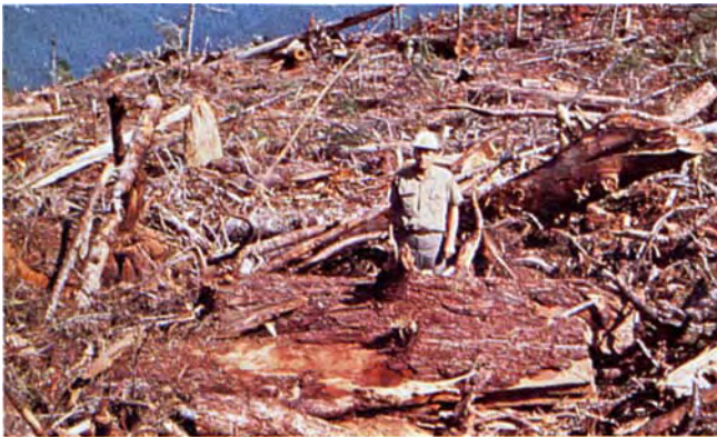
Photo 37. West coast Douglas-fir clear-cut, quality of cull high.