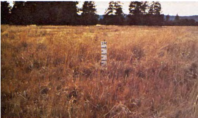
Photo 7. Meadow foxtail in Oregon prairie and meadowland.