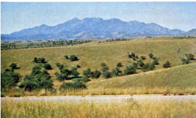
Photo 2. Live oak savanna of the Southwest on the Coronado National Forest.