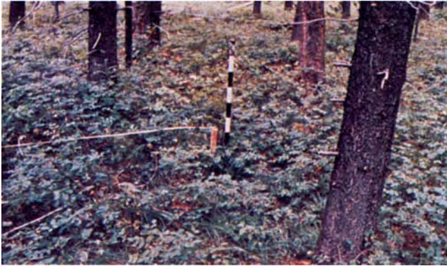
Photo 13. Green, low shrub fields within timber stands or without overstory are typical. Example is Douglas-fir–snowberry habitat type.