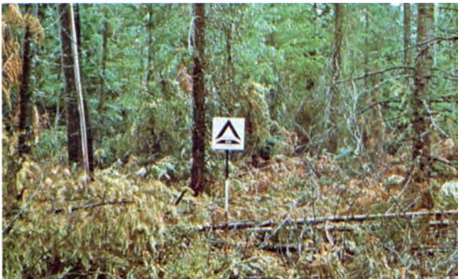
Photo 38. High productivity of cedar-fir stand can result in large quantities of slash with high fire potential.