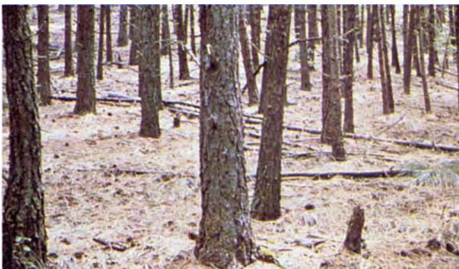
Photo 27. Long-needle forest floor litter in ponderosa pine stand near Alberton, Mont.