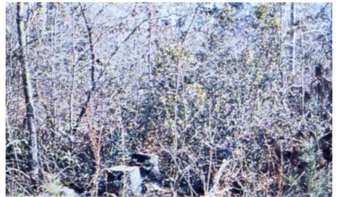
Photo 16. Southern hardwood shrub with pine slash residues.