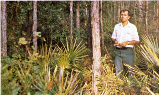
Photo 20. Southern rough with moderate to heavy palmetto-gallberry and other species.