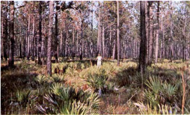
Photo 19. Southern rough with light to moderate palmetto understory.