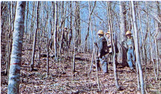
Photo 26. Loose hardwood litter under stands of oak, hickory, maple and other hardwood species of the East.