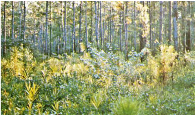
Photo 21. Slash pine with gallberry, bay, and other species of understory rough.