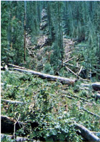
Photo 31. Slash residues left after skyline logging in western Montana.