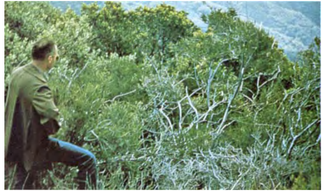
Photo 9. Mixed chaparral of southern California; note dead fuel component in branchwood.