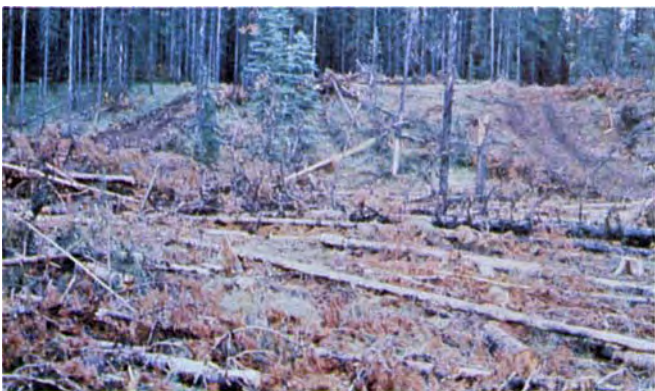
Photo 33. Light logging residues with patchy distribution seldom can develop high intensities.