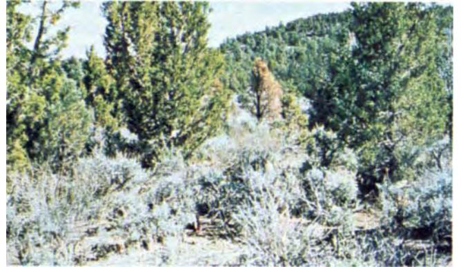
Photo 15. Pinyon-juniper with sagebrush near Ely, Nev.; understory mainly sage with some grass intermixed.