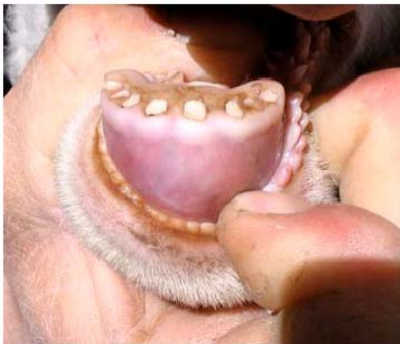
Figure 2. Excessive but even wear of incisive teeth in an adult sheep with only root stubs remaining.

Livestock exhibited excessive tooth wear following the PCCVE, being notable in cheek teeth, but particularly in incisive teeth. Prime-aged sheep had incisors evenly worn down to the gums (Figure 2).