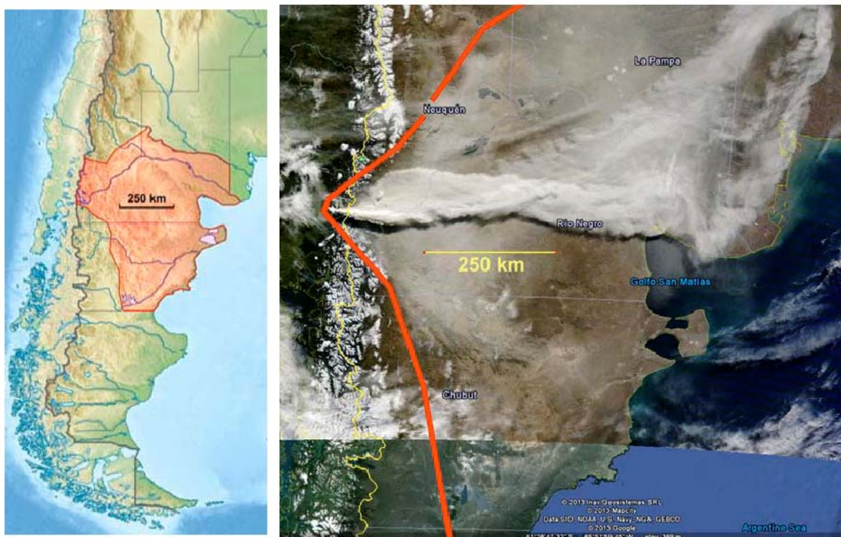
Figure 1. Distribution of tephra deposited from the Puyehue-Cordon Caulle volcanic eruption, showing the Moderate Resolution Imaging Spectroradiometer image of 13 June 2011, http://earthobservatory.nasa.gov . The red line marks the limit of deposition,

Although initially concerned about fluorosis, based on incidences from other Chilean volcanoes, only fluorine-containing microbubbles that may turn into fluorohydric acid upon contact with water were suggested to possibly occur in tephra (Bermúdez and Delpino 2011). Moreover, water-soluble extracts from tephra revealed low fluoride levels (0.7 ppm; Hufner and Osuna 2011), surface water analyses from both countries revealed low fluoride levels, and overall water consumption was considered without risk for humans and animals (DGA 2012; Wilson et al. 2012). Still, livestock losses in the region receiving tephra were high, but attributed to inanition, rumen blockage and excessive tooth wear, rather than to known toxic elements (Wilson et al. 2012). Apparently only one Chilean analysis was conducted on fluoride levels in forage plants and animal tissues from the PCCVE: forage fluoride levels were >3-fold higher than accepted levels, while levels in tephra and blood from livestock were also elevated (Araya, cited in Flueck and Smith-Flueck 2013). Given these observations in Chile and overt fluorosis documented from the nearby 1988 eruption, reasons for absent fluorotic cases from PCCVE remained elusive.