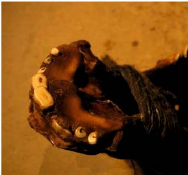
Figure 3. Excessive tooth wear in sub-adult teeth due to abrasion from volcanic tephra and chemical impact. Note extensive wear on first incisors, with exposed pulp cavity, in presence of milk incisive teeth (except the left permanent I2 which is just emerging)

the I1 was so advanced that practically all posterior enamel was ablated and the underlying pulp cavity exposed, while incisors 2 and 3 were still milk teeth (Figure 3).